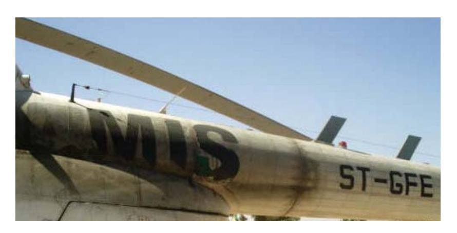
Figure 2 Mi-8 helicopter with Sudanese armed forces registration number and AMIS being erased

44. In addition, the Government of the Sudan continues to use white aircraft similar to those used by AMIS, the United Nations and some international non-governmental organizations (see fig. 2). While the use of white and unmarked aircraft is not prohibited, the transfer of such aircraft into Darfur for military use constitutes a violation of the arms embargo. It is also an impediment to the peace process, as the practice of using white vehicles and unmarked aircraft presents a real danger for the peacekeeping forces and humanitarian organizations operating in Darfur.